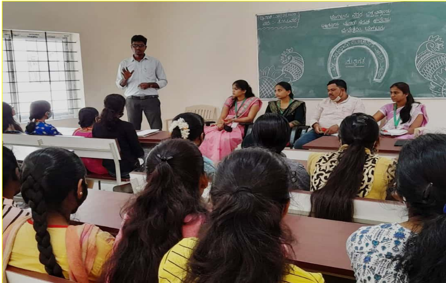
Celebrated World Mother tongue day at MDCCW on 21st February 2022