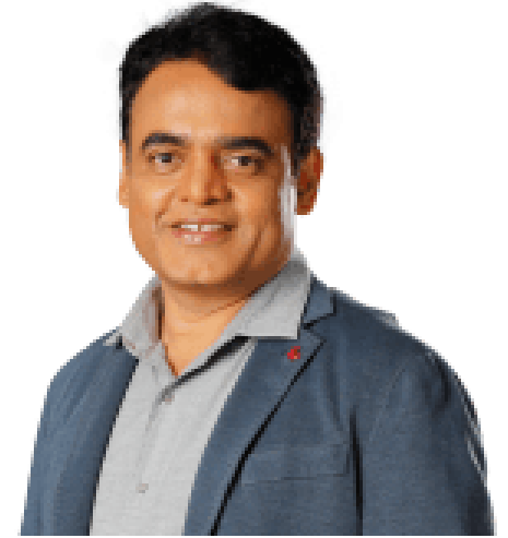
Dr. C N ASHWATH NARAYAN

The College was established in the newly constructed building in the premises of Government PU College in the Constituency of our Hon'ble Minister, who is instrumental in establishing Malleswaram as an educational hub of prominence in Bengaluru.