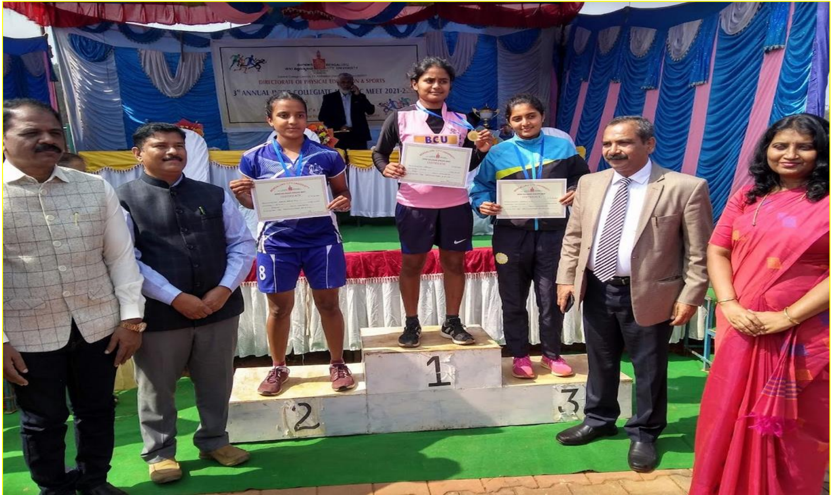
Participated in BU Inter-College sports meet in 2022