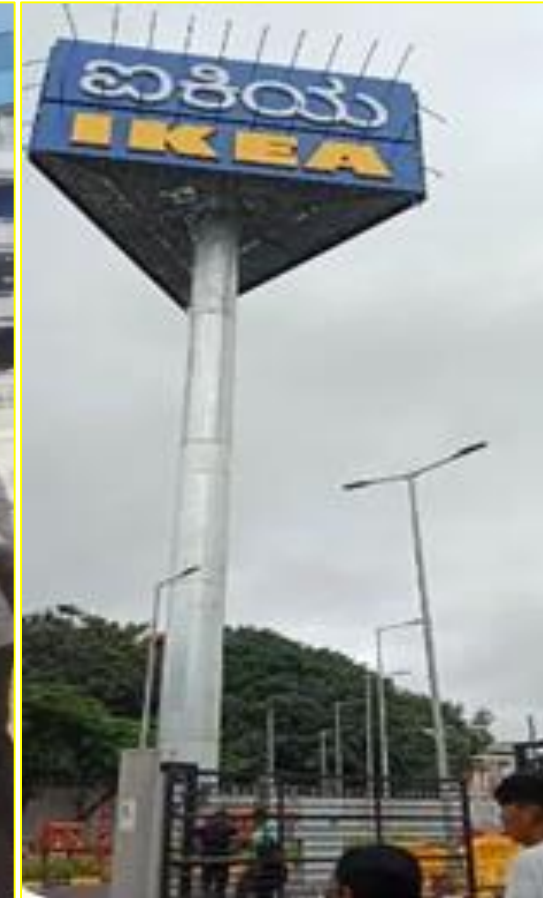
B.Com Students on Industry Visit to IKEA Furniture at Nagasandra, Bengaluru on 6th July 2022